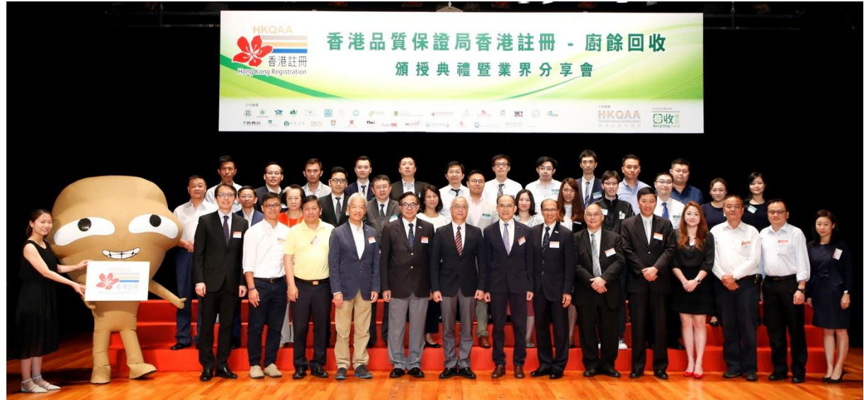
Guests, representatives of the "HKQAA Hong Kong Registration – Food Waste Recycling" pilot scheme participating organisations and "Big Waster".